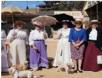
Ladies from the Victoriana Society displayed beautiful costumes from yesteryear and joined the Governor for a photo shoot.