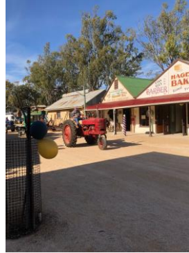
Right: the day ended with a Parade of Tractors and other old vehicles enjoyed by visitors and drivers alike. It’s hard to say who enjoyed it more – spectators or participants!

STATISTICS: Current Membership numbers are: Individual Members: 96 Family Membership: 11 Individual year passes: 45 Family year passes: 26